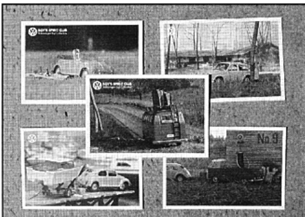
At first glance they almost look real. However, I bet it would take a pretty big boy to hoist that somewhat large luggage onto the roof of that Bandai Microbus.